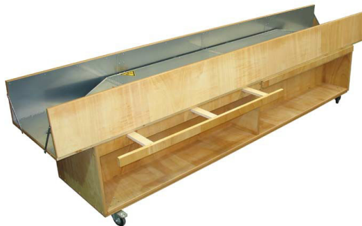
SL 50-s, view 2