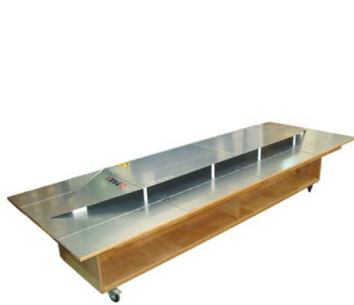
SL 50-s, version with hinged desktop, view 1