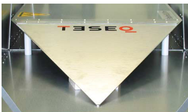
SL 50 detail view