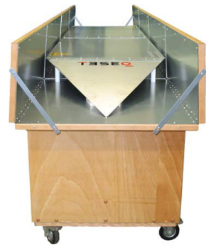
SL 50-s, view 3